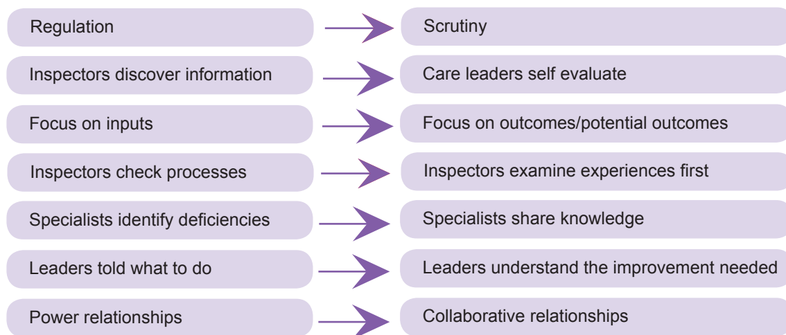
Fig 2. The shift from compliance to improvement support